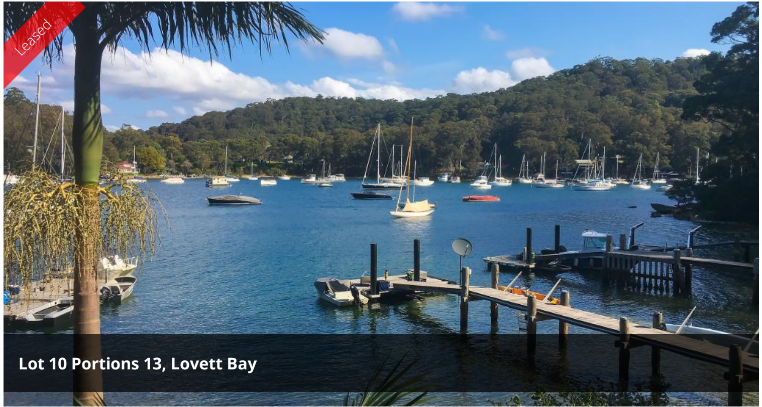
Lot 10 Portions 13, Lovett Bay