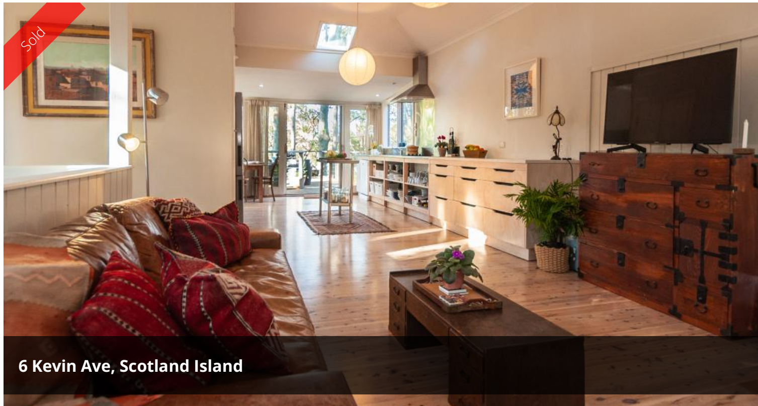
6 Kevin Ave, Scotland Island